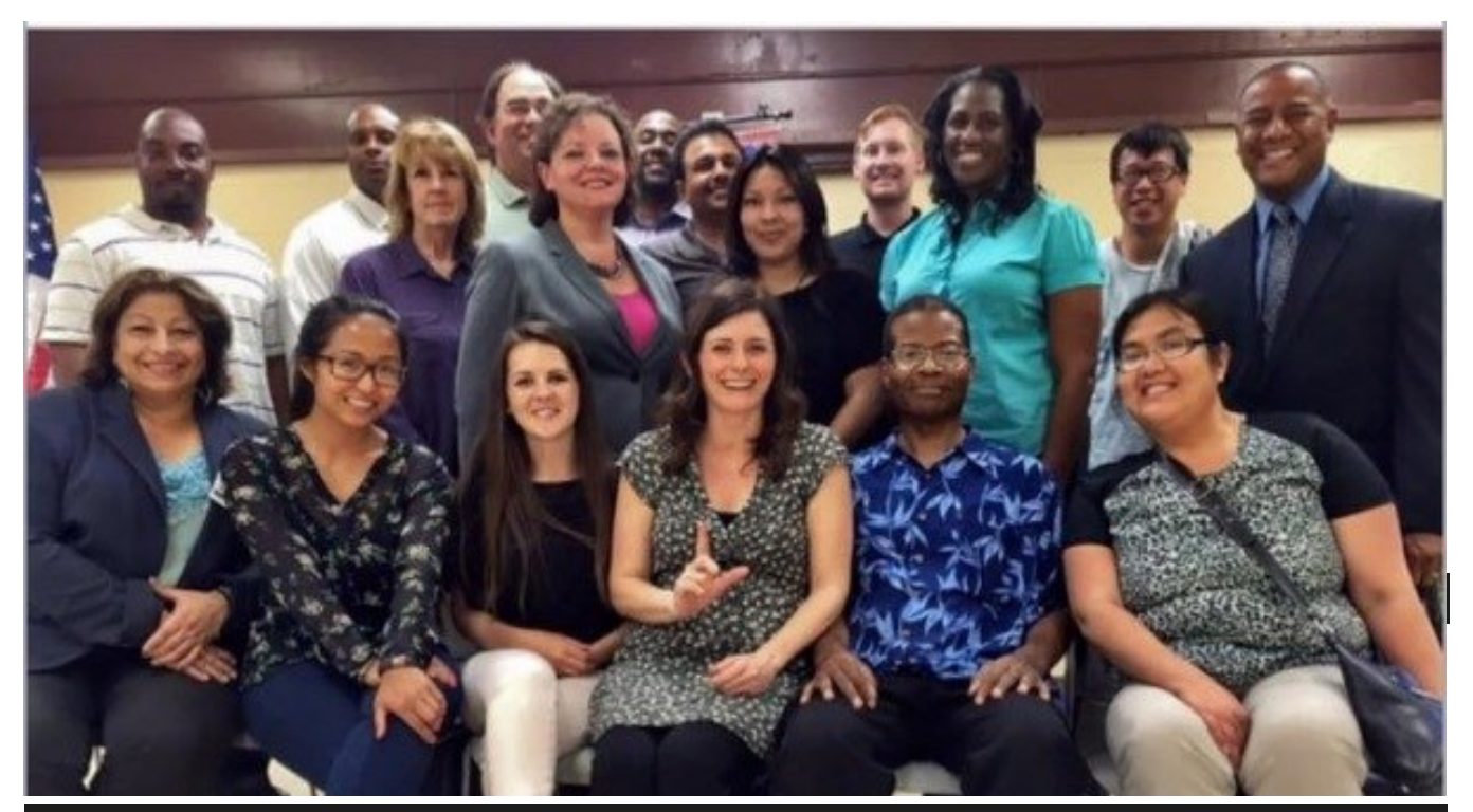
Lakewood Toastmasters has a lot to smile about.